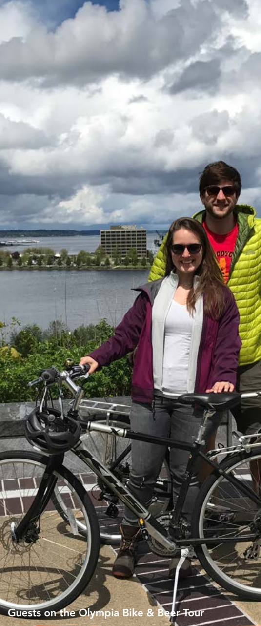
Guests on the Olympia Bike & Beer Tour