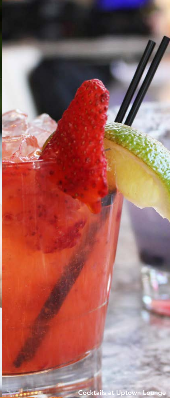
Cocktails at Uptown Lounge